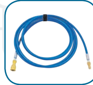
80-8007-A 15 ft. Solution Hose