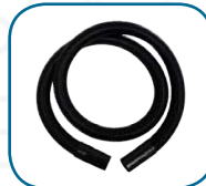
50-1008-A 15 ft. Vacuum Hose