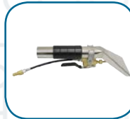
10-0501 4" S/S Upholstery Tool