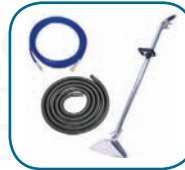
80-0500 Hoses and Wand Kit