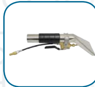
10-0501 4" S/S Upholstery Tool