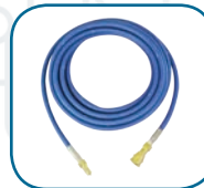
80-0502 25 ft. Solution Hose Assembly