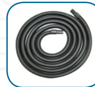
80-0503 25 ft. Vacuum Hose with Cuffs Assembly