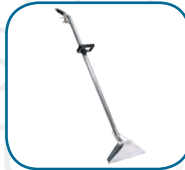
10-0861 12" S/S Dual Jet S-Bend Wand