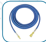
80-0502 25 ft. Solution Hose Assembly