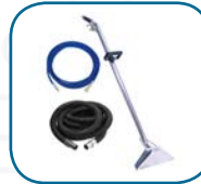
80-0500 Hoses and Wand Kit