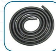
80-0503 25 ft. Vacuum Hose with Cuffs Assembly