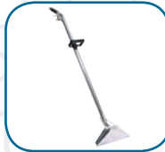
10-0861 12" S/S Dual Jet S-Bend Wand