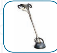
10-0859 12" Hard Surface Turbo Brush Tool