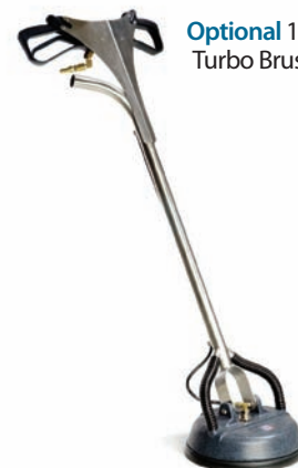
Optional 12" Hard Surface Turbo Brush Tool 10-0859