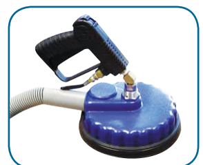
Optional 7" Hard Surface Turbo Brush Tool 10-0874