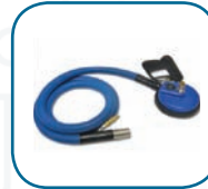
10-0874 7" Hard Surface Turbo Brush Tool