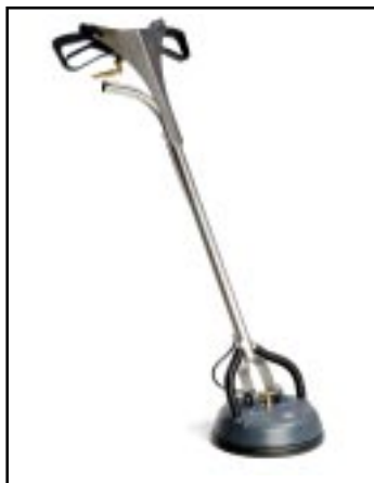
10" Turbo Brush Hard Surface Cleaner

Built from durable Rotational Molded Polyethylene , these components can withstand even the toughest working environments. The spinning-components are stainless steel with ceramic washers for the maximum in quality and reliability, compare our features and there's only one choice, Sandia.