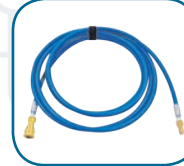
80-8007-A 15 ft. Solution Hose