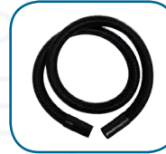
50-1008-A 15 ft. Vacuum Hose