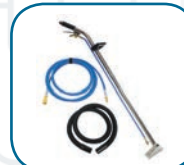
80-8009-A Hoses and Wand Kit